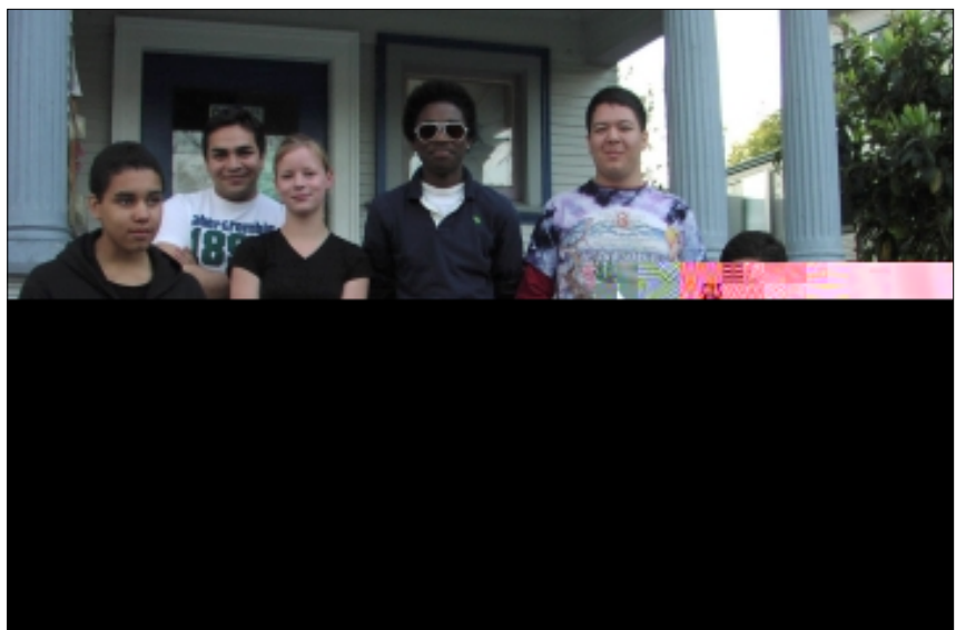
LOUD Voices Leadership team:

‘Youth Program Update’ continued on page 4